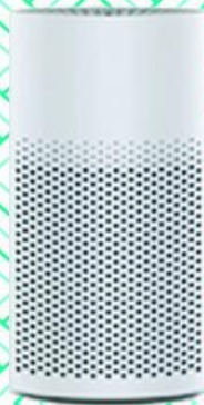
Mini Air Purifier