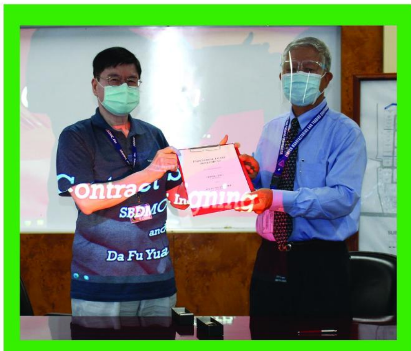
Industrial Lease Agreement Signing of SBDMC, Inc. & Da Fu Yuan September 9, 2020