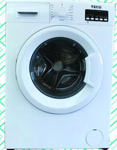
Front Load Washing Machine